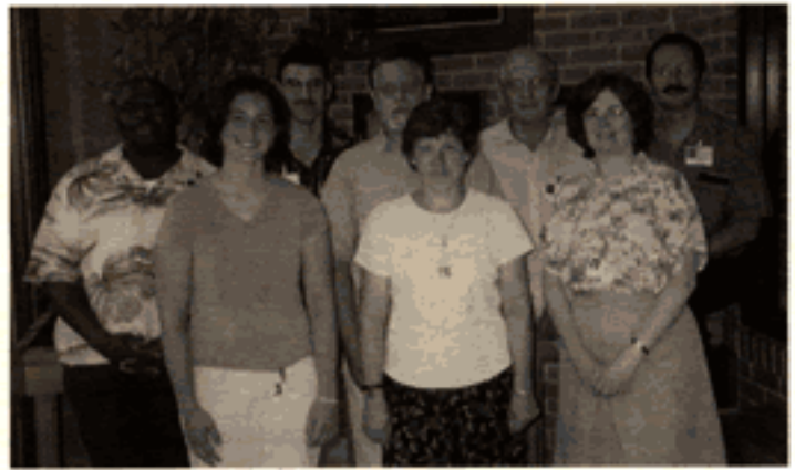
Current Paid Staff at LCP:

At the annual SFPM picnic in September, the board of directors took time to say THANKS to their special group of chaplains and support staff who work hard and are committed to taking the message of God's love behind bars. Currently, SFPM hires 11 paid staff (about 7 full-time equivalent) and supervises another 12 regular volunteers (2 ½ full-time equivalent) who are approved and badged by Lancaster County to go into the Prison and Youth Center.