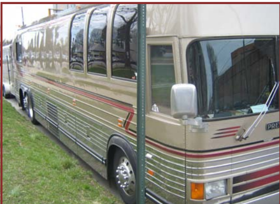
New Creation Team bus parked outside Lancaster County Prison

Invitations were also distributed inviting the same inmates to attend a one day "Bondage to Freedom" seminar. This is a life-changing teaching about broken relationships, rejection and forgiveness that has been used in many prisons throughout the United States.