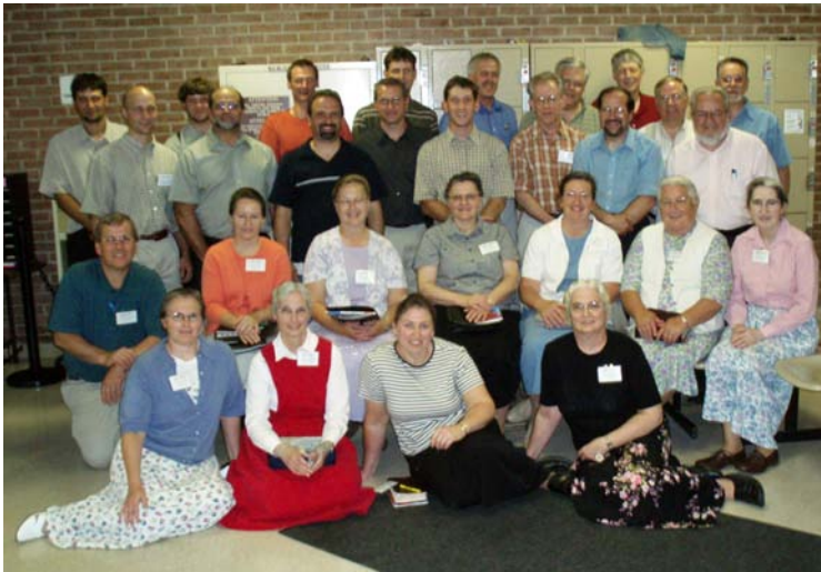
Monday, April 30 Gospel Express volunteers gather in LCP.

The first session on broken relationships began with emphasis on how Jesus and the truth can set all people free. Examples were given of how lust, fear, anger, and abuse lead to so many broken relationships. A paper was distributed with a drawing of a man in terrible shape - all weighted down and being crushed in life by problems. The second page showed the same man letting all his burdens at the cross and the joy and freedom that he experienced. A man at my table exclaimed “Wow. Just last week a counselor told me I must come to the end of myself. . . Give up my wrong ways before it is too late. When I saw that drawing of the man weighted down and the sign at his feet ‘Come to the end of yourself before it’s too late’ I knew that was a message for me.”