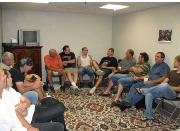
An “Addicts to Disciples” teaching session that happens Tuesday evenings in Leola, PA.