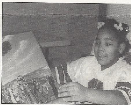
Learning from flannelgraph lesson

Most group meetings have an activity like games, craft, singing or cooking projects. This gives opportunity for interaction with persons and works as a great "ice-breaker". Then a volunteer leads