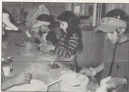
Girls baking cookies