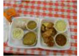
Chicken Dinner from 4-7 Friday night Take out meals at Martin's Country Market

OCTOBER 26 & 27, 2018 EPHRATA BUSINESS CENTER 400 W. Main St, Ephrata