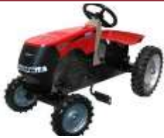
Pedal Tractors, tools, and Winross trucks

Please consider supporting us on November 16. Thank you!!