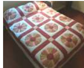
Quilts, afghans, wall hangings

Many Valuable Gift Certificates from area businesses for food, lodging, professional and home services.