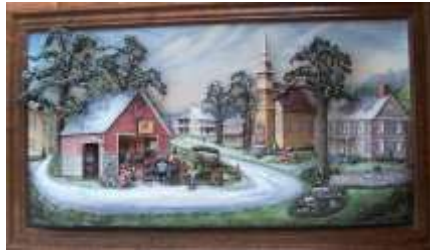
Two 3D pictures made by Lorraine Reiff will be sold Saturday Both are detailed and original