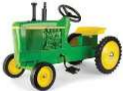
Pedal Tractors, tools, and Winross trucks

Please consider supporting us on November 22. Thank you!!