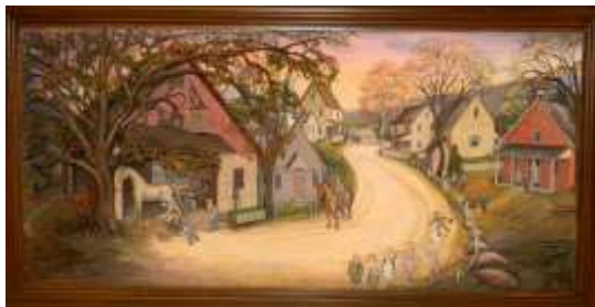
3D picture made and signed by Abner Zook, Womelsdorf, PA July 1988 51" x 21"