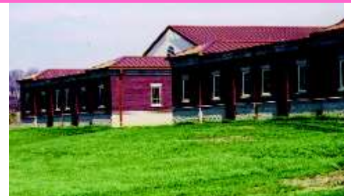
Youth Intervention Center (YIC)