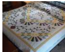
Quilts, afghans, wall hangings