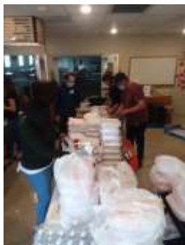
Chaplain staff and families packing meals

After the SFPM Board realized it would not be able to operate the 37 th Annual SFPM Benefit Auction due to State PA COVID-19 restrictions it was decided to operate a multi-site, drive thru Chicken Dinner. Because of the size and income of the Auction we knew we could not totally replace the lost income it brings to the ministry, but the chicken dinner seemed a good alternative.