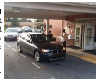
Chaplain staff and families serving meals at Mellinger Mennonite